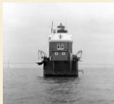
Sandy Point Shoal Lighthouse 1961