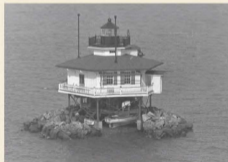
Love Point Lighthouse - 1952