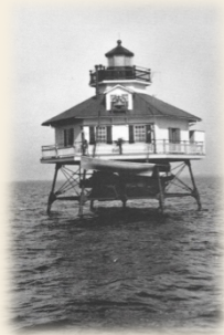
Janes Island Lighthouse – 1879 U.S. Coast Guard Photo