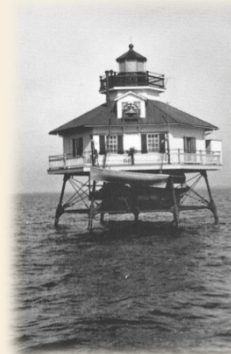
Janes Island Lighthouse – 1879