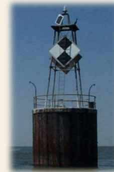
Janes Island Light – 2018 U.S. Coast Guard Photo

Historical placard placed by the Chesapeake Chapter of the United States Lighthouse Society, cheslights.org