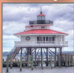
Choptank River Lighthouse Replica