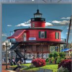
Seven Foot Knoll