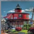
Seven Foot Knoll