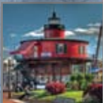
Seven Foot Knoll